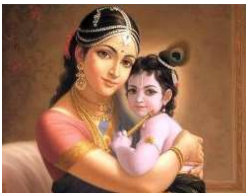
Fig .1 Original Image

Edge detection is the concept for a set of mathematical methods whose aim is to identify the points in a digital image at which the image brightness changes sharply or, more formally, has discontinuities. Edges typically occur on the boundary between 2 regions[2]. Edge is defined as the boundary pixels that connect two separate regions[3] with changing image amplitude attributes such as different constant luminance and tristimulus values in an image. Edge detection is a well developed field on its own within image processing. The main features can be extracted from the edges of an image which significantly reduce the amount of data to be processed while preserving the important structural properties of an image[1].The example of an original image and image after edge detection are shown in Fig. 1 and Fig. 2 respectively below.