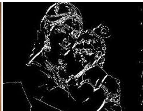
Fig. 2 Image AfterEdge Detection